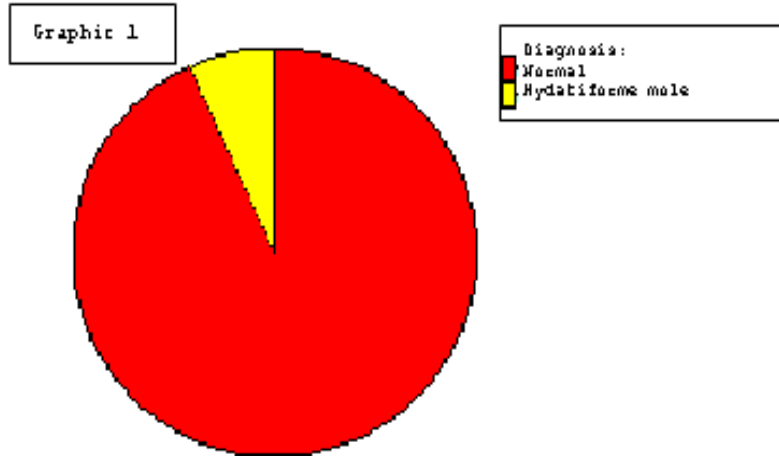
Graphic 1. HM incidence among study population

The age range of 277 cases included in the study is between 17 and 53 years (median 31). Mean age is 31.93 \pm 7.158.258 (93.1%) of the cases were normal pregnancy products while HM was detected in 19 (6.9%) cases (Graphic 1). The mean age of 19 HM cases was determined as 33.05 \pm 7.322 (median 33). The incidence of HM typing results according to histopathological findings in all cases in the study population is given in Table 1. The frequencies of HM types among themselves are given in Table 2.