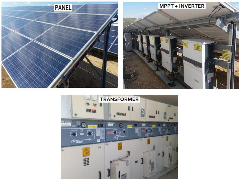
Figure 2. A view from module, MPPT + inverter and transformer of the system

Technical specifications of polycrystalline silicon PV module is given in Table 1. As seen in Table 1 that each PV module has 60 cells, 16.32% peak efficiency (under STC: Standard Test Conditions: irradiance @ 1000W/m 2 with an air mass 1.5, module temperature @ 25°C and @ 0m/s wind speed), 1.6236m 2 area, 18.5kg mass, 45±2°C nominal operating cell temperature and 97.5%, 90.0%, 80.0% of overall efficiency for first year, 10 years and 25 years, respectively (Table 2). The efficiency of solar PV panels is affected by environmental and climatic conditions, temperature, dust and using time [2, 3, 7, 13, 15, and 16]. In addition to this, other components of the SPPs such as MPPT, inverter, and transformer has efficiencies that commonly changing between 95%...99% [9]. The maximum efficiency of solar panels can also be gathered in first year.