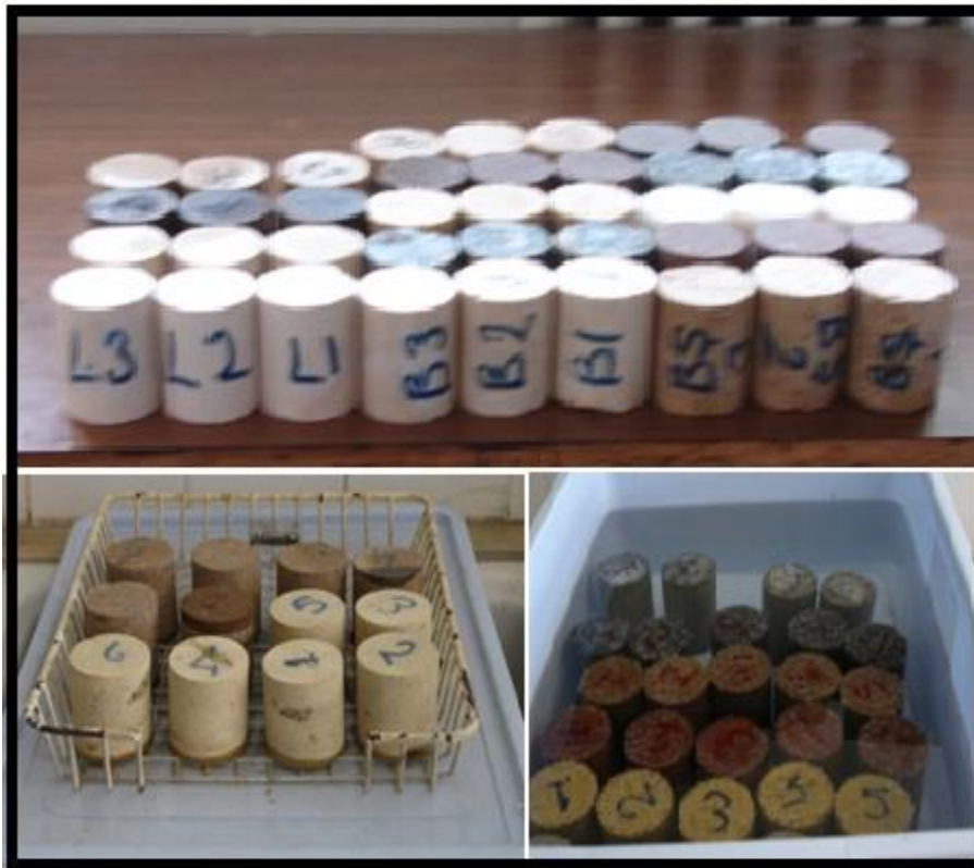
Figure 1. Examples of specimens used in the experiment

Water absorption experiments were carried out on 20 different rocks. Experimental samples were taken from the stone processing plants in block form. The specimens were prepared in the laboratory as cores 54x72mm (Figure 1).