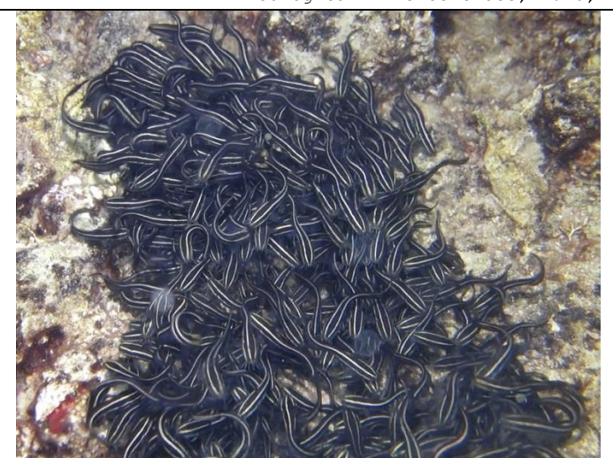
Figure 1. P. lineatus aggregation was observed in the diving area

The number of individuals in the population was over 10 and, also P. lineatus was usually observed under rocks and dark habitats with aggregations. The total transect area monitored on Iskenderun and Mersin coasts were 2.0 ha. The mean density comprising 10-20m depth range was 106n/ha^{-1} (Table 1; Figure 2).