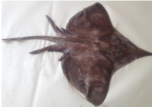
Figure 3. Mature male specimen of Dipturus oxyrinchus

According to Castro [5], the decision regarding the use of the study area as a nursery by a given species was made considering the