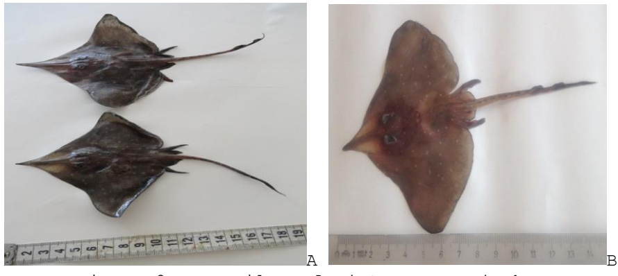
Figure 2. Juveniles of Dipturus oxyrinchus

Total lengths and weights of D. oxyrinchus were 14.6-21.8cm and 9.53-26.03g, respectively. Thus, this study provides the first record of egg capsules and juveniles long-nosed skate from the North-eastern Mediterranean Sea. The presence of juvenile individuals and adult male of D. oxyrinchus in May and June, in the same area suggests that there is egg laying and nursery in the North-eastern Mediterranean.