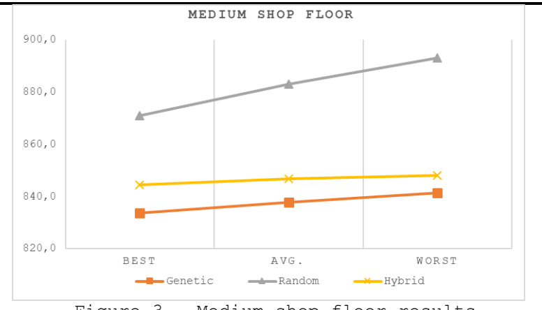
Figure 3. Medium shop floor results

Final shop floor is the biggest shop floor with 200 jobs and 40 machines. To save from computer memory usage and from CPU time we preferred 3 alternative routes for every job. CPU times were approximately in between 800 to 2600 seconds. Results of this shop floor are given at table VI and figure 4. From the results we can see hybrid search as the best solution technique and full integration level found the best integration level.