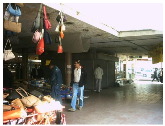
Figure 5. The street peddlers and closed shops on the ground floor of the old hotel building, 2005

(Şekil 5. Eski otel binasının zemin katındaki işportacılar ve kapalı dükkanlar)