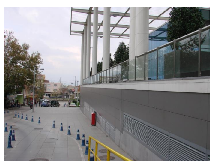
Figure 11. Isolation of the City Square (Şekil 11. Kent Meydanı'nın çevresinden yalıtılmışlığı)

Moreover the name of the "City Square" has some hidden meanings. First of all, the word of "city" emphasize a sense of belonging to the citizens. Also, there is an effort to create a difference with the "square" from the other shopping centers. The symbolic figure of the City Square Shopping Mall is a wind rose which can be connected with the southwesterly wind, prevailing wind of Bursa. There is a tower (Figure 10) actually which serves as an advertisement surface and increases the visibility of shopping center from everywhere.