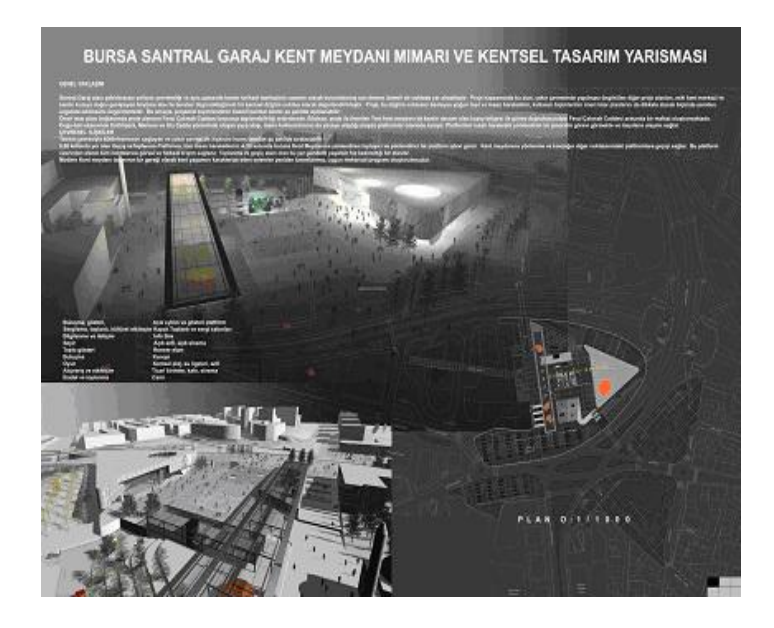
Figure 7. Renderings from the first prize project of the Bursa Central Garage City Square Architectural and Urban Design Project Competition (Şekil 7. Bursa Santral Garaj Kent Meydanı Mimari ve Kentsel Tasarım Projesi Yarışması birincilik ödülü alan proje)

After the competition, the area which was owned by the Metropolitan Municipality of Bursa (%41) and Head Office of Pensioners' Institute (%59), was rented to a private company for 49 years. Then, the buildings in the Central Garage which embodied an important example of modern architectural heritage in Bursa and Turkey, and had a symbolic value in urban memory, were demolished completely in 2006. In the implementation phase, the project was revised in terms of fuctional and spatial organization. Commercial facilities, the total building area of the project and the stories were increased. In the new project, shops, eating-drinking activities and cinema halls were placed in the triangular block, shops and cafes were placed in the building under the canopy, exhibition hall and shops were placed in the other building between these blocks. In addition to these, a super market, a playground and parking places were placed under the ground. Thus, the City Square (Figure 8) became an indefinable courtyard of a shopping center in the new Central Business District of Bursa.