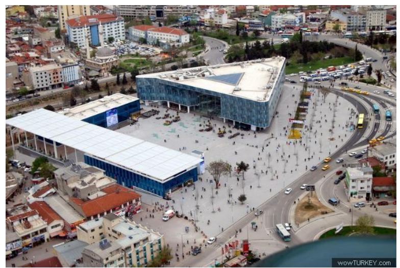
Figure 8. The aerial view of the City Square (Şekil 8. Kent Meydanı hava fotoğrafı)

Actually, there are some problems about the relations between form and function too. Both the pedestrian-car relations and the pedestrian accesses have not been solved successfully in the site plan. The size of the square, green areas and precautions for climatic conditions are insufficient. The relation between the inside and the outside is very poor. Actually, the architects stated that they were inspired by the cocoon of an insect and the structure of the old passenger hall while they were designing the facades of the triangular block and the canopy. It seemed that the architects used the iconic design method.