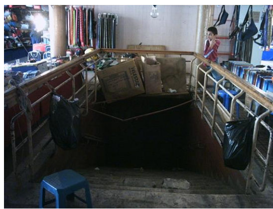
Figure 6. The unused basement of the old passenger hall 2005 (Şekil 6.Yolcu holü binasının kullanıma kapatılmış bodrum katı)