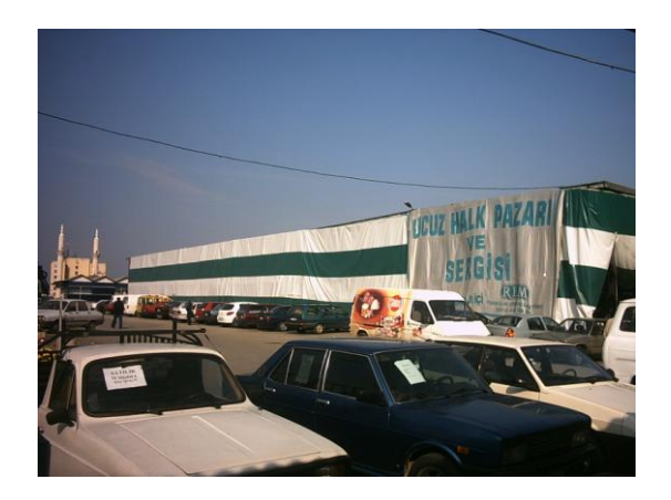
Figure 4. The cheap marketplace in the old Central Garage area, 2005 (Şekil 4. Eski Santral Garaj'daki çadır pazarlar)