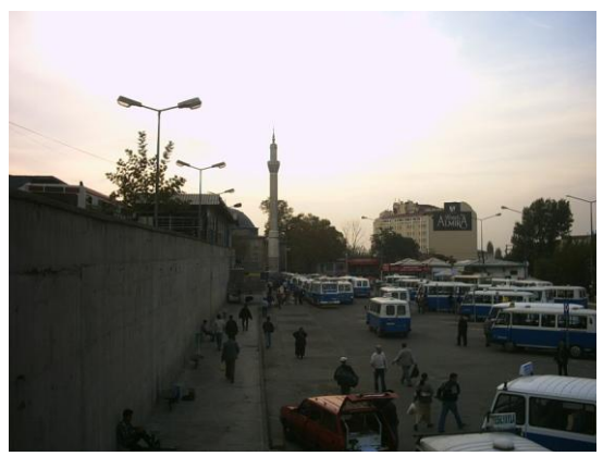
Figure 3. The minibus terminal in the old Central Garage area, 2005 (Şekil 3. Eski Santral Garaj'da minibus durakları)