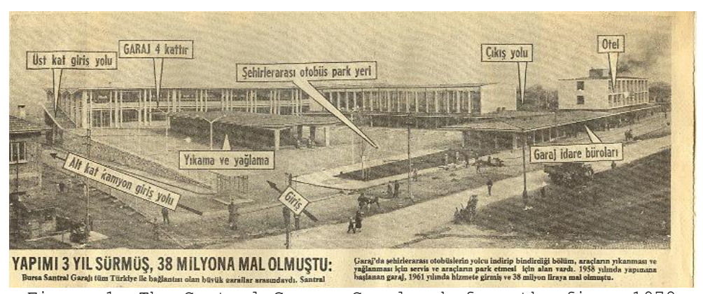
Figure 1. The Central Garage Complex before the fire, 1978 (Şekil 1. Yangından önce Santral Garaj kompleksi)

The Central Garage complex (Figure 1) which covered approximately 1.7 hectares had been opened in 1961. It had been constituted of the garage building in the north, hotel building and the offices under the canopy in the south, passenger hall building, bus service building and platforms in the middle of the complex. Buildings were the examples of rationalist-purist style which was the result of independent and universal architectural movements developed after the Second National Architecture Period [16]. Architects (Mesut Evren ve Ali Nihat Hasekioğlu) had a design approach which invokes both local and international architecture.