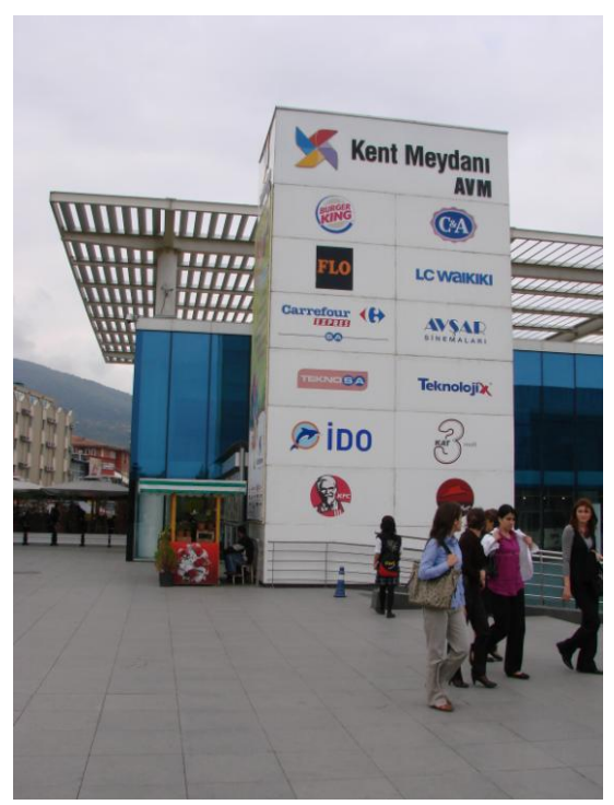
Figure 10. Advertisement tower in the City Square (Şekil 10. Kent Meydanı'ndaki reklam kulesi)

place to change the identity of this place. However, it can take time for people to get used to this new name.