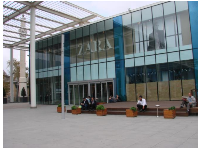
Figure 9. One of the luxury shops in the City Square (Şekil 9. Kent Meydanı'ndaki lüks mağazalardan biri)

According to users, the most positive thing resulted with this project is that the area became a safer place and the quality of users changed. But these changes do not affect the image of the City Square. When it is asked users what they remember when they think about the City Square, the users' answers are like below: