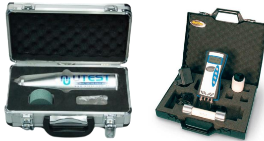
Photo 13. Concrete test hammer (Schmidt Hammer) and ultrasonic signal velocity tester [URL-7]